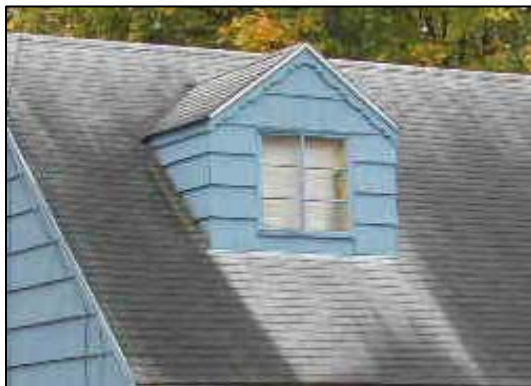
Extensive algae growth.